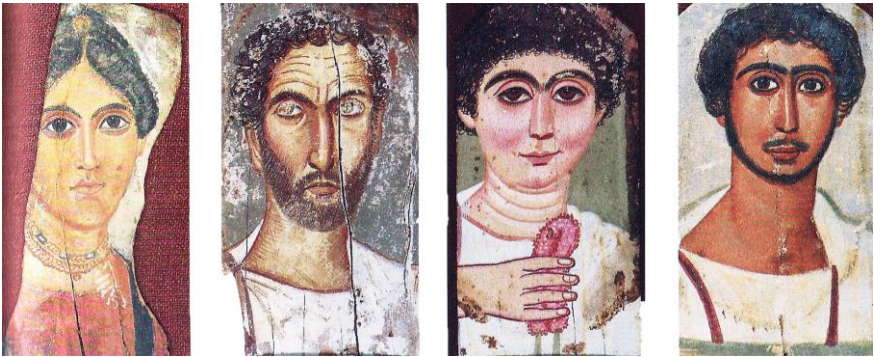
These are the type of mongrels that composed the first Christians. The image is taken from funerary portraits of faithful resemblance to Greek-speaking people residing in Egypt. The portraits survived thanks to the dryness of the Egyptian climate. Although it is impossible to say who these men or women were, all were early Christians.

Subsequently, numerous preaching centres are founded in North Africa, Syria and Palestine, inevitably going to Greece and Rome itself. Christianity ran like wildfire through the most humble layers of the population of the Empire, which were the most ethnically orientalist layers. It then passes to the Roman Empire through the Jews, headed by Sha'ul/Paul, Peter and other preachers. Its nature, based on the sinister Syrian-Phoenician mysteries that presupposed the sinfulness and impurity of the being which practiced them, is attractive to the non-white majority: Rome's slaves.