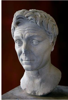
Pompey the Great

After the fall of Jerusalem, all the territory conquered by the Hasmonean or Maccabean dynasty was annexed by the Roman Empire. Hyrcanus II remained like the governor of a district of Rome under the title of ethnarch, dominating everything that Rome had not annexed: the territories of Galilee and Judea, which would pay taxes to Rome but would retain their independence. Hyrcanus was also made a High Priest, but in practice the power of Judea went to Antipater of Idumea, as a reward for having helped the Romans. Pompey annexed to Rome the most Hellenised areas of the Jewish territory, while Hyrcanus remained as a governor of a district until his death.