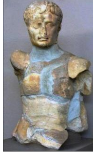
A statue of Augustus, the first Roman Emperor, who was obviously pagan. It was disfigured by the Christians, who engraved a cross on the forehead.

organise nothing more and nothing less than a concentration camp for the adepts of classical culture, detained throughout the empire. In this field those who profess the old beliefs, or who simply opposed the Church, are imprisoned, tortured and executed. Over time, Scythopolis becomes a whole infrastructure of camps, dungeons, torture cells and execution rooms, where thousands of Hellenists would go. The most intense horrors of the time take place here. It was the gulag that the communism of the time used to suppress the dissidents. 11