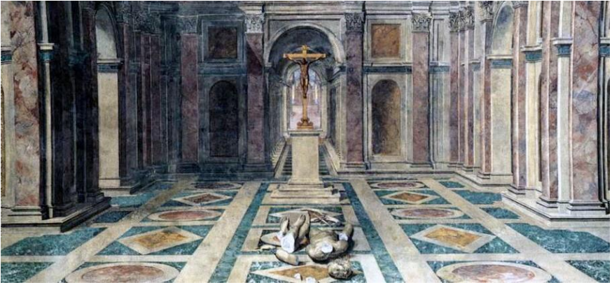
Tommaso Laureti, The Triumph of Christianity (also called The Triumph of the Cross , painted in 1585): The story of how an oriental messiah came to replace the strong pagan gods.

Originally published on May 2013 in Spanish on Evropa Soberana's site ( http://europasoberana.blogspot.com ).