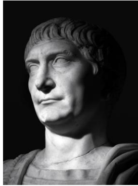
A bust of Trajan: the first emperor of Hispanic origin. He had the honour of having ruled the Roman Empire when its borders were most extensive.

partly because it treated them much better and partly because it was the only really serious enemy that lurked the borders of the Roman Empire in the East; they were the only power capable of liberating Jerusalem. After all, the Parthians were the ones who killed the hated looter Crassus during the Battle of Carrhae, and if the Romans were anti-jewish and the Parthians were enemies of the Romans, the opportunist strategy of the moment considered the Parthian Empire as a pro-jewish regime. At this time, nothing would have pleased the jews more than a military campaign that conquered Judea, Syria, Asia Minor in general and, if possible, Egypt, as the Persians had done before.