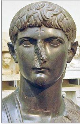
A bust of Germanicus defaced by Christians who also engraved a cross on his forehead.

In Alexandria, where the tensions were always very common, the pagan minority, headed by the philosopher Olympius, carries out an anti-Christian revolt. After bloody street fights with dagger and sword against crowds of Christians who outnumber them greatly, the traditionalists entrench themselves in the Serapeum, a fortified temple dedicated to the god Serapis. After encircling the building, the Christian mob, under the patriarch Theophilus, breaks into the temple and murder all those present; desecrates the cult images, plunders the property, burns down its famous library and finally throws down all the construction. It is the famous ‘second destruction’ of the Library of Alexandria, the jewel of ancient wisdom in absolutely every field, including philosophy, mythology, medicine, Gnosticism, mathematics, astronomy, architecture or geometry: a spiritual catastrophe for the heritage of the West. A church was built on its remains.